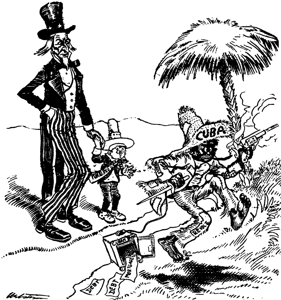
Cartoon 6. UNCLE SAM to PORTO RICO: @And to think that bad boy came near being your brother!@ (Chicago Inter Ocean, 1905.)