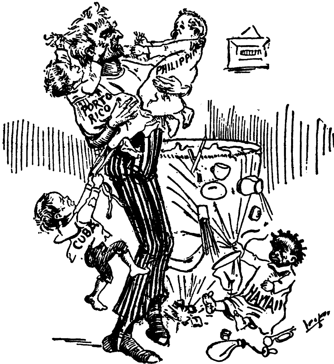
Cartoon 2. How Some Apprehensive People Picture Uncle Sam after the War. ( Detroit News , 1898.)