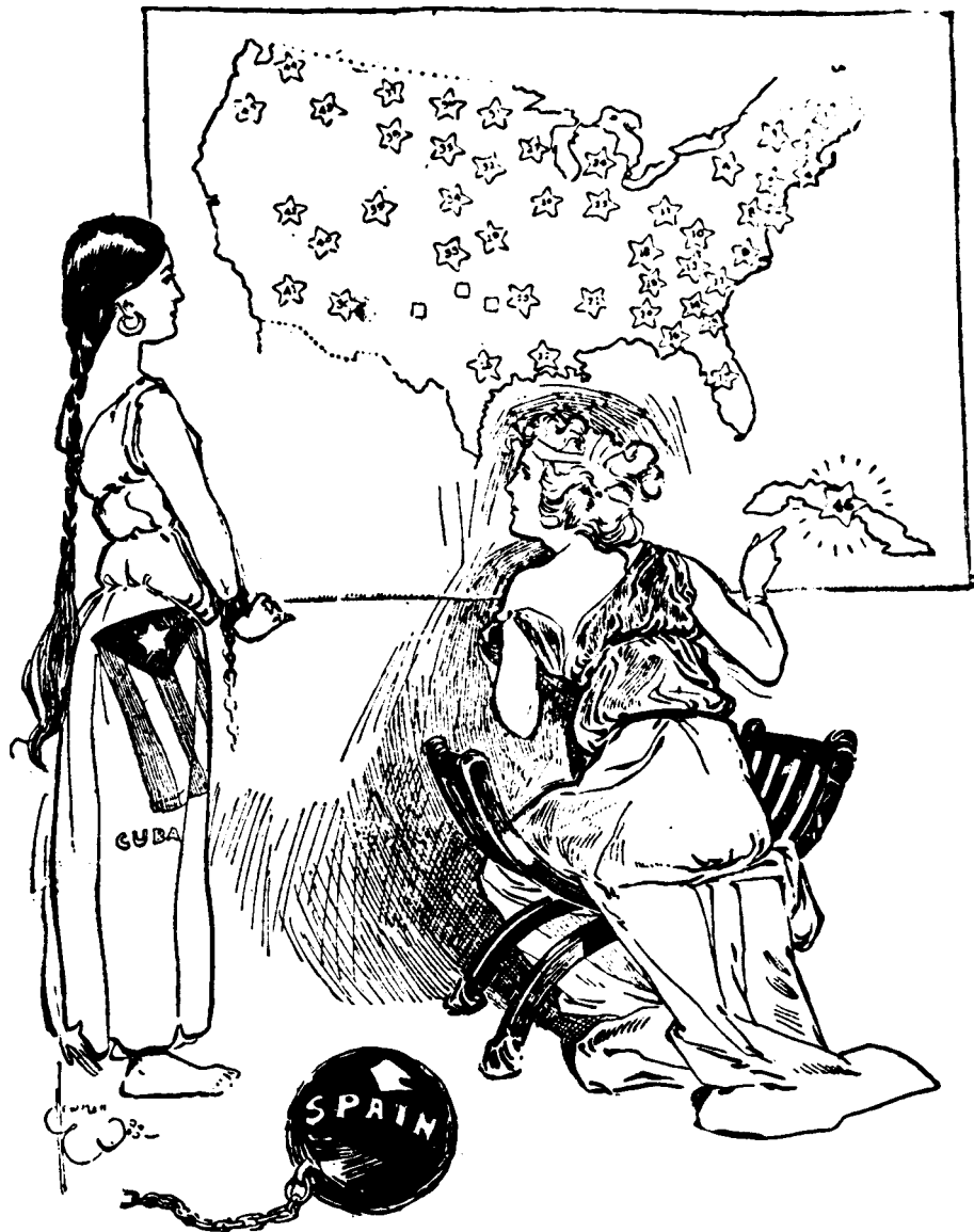
Cartoon 4. Miss Cuba Receives an Invitation. MISS COLUMBIA (to her fair neighbor): @Won@t you join the stars and be my forty-sixth?@ (Chicago Record-Herald, 1901.)